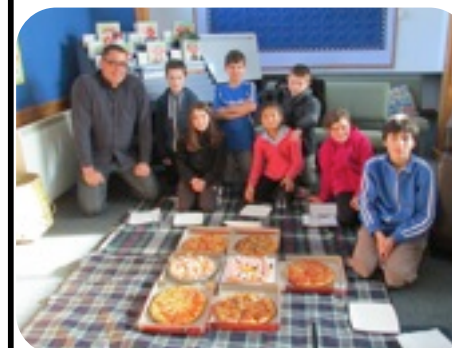
Team Kauri: Picnic with the Principal

Have a great week everyone and I look forward to seeing you around the school.