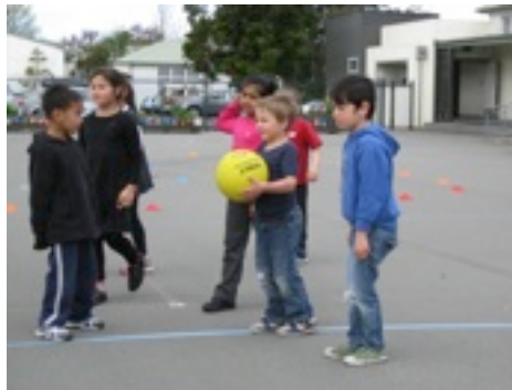
Students enjoyed Kiwisport in Term 3.

If you don't have internet access, school office staff can provide you with a printed copy of the policy and the review form.