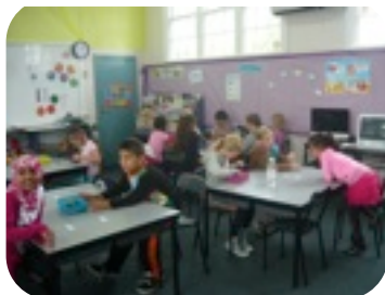
posing for their photos during Artspiration

Room 7 get to know each other through discussions and regularly moving desks. The children had a lot of fun