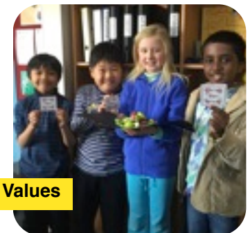
Students Living our Values